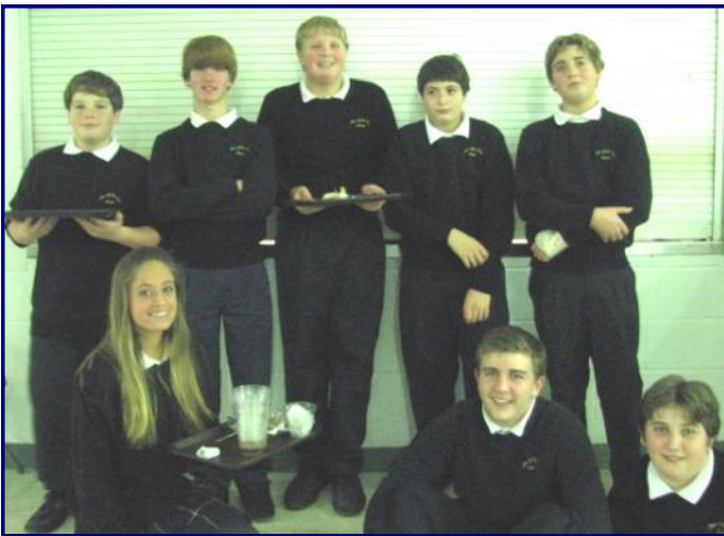
Eighth grade servers at Monsignor’s parish appreciation dinner